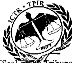
[Seal of the Tribunal]